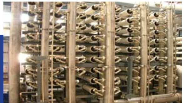
Fujairah, U.A.E. SWC Installation 45 MGD (170,000 m 3 /d.)

SWC4 (8" and 16"), SWC4+, SWC4+B (high boron rejection), SWC4+Max (high flow, rejection and boron rejection), SWC4+B Max, SWC5 (8" and 16"), , SWC5-LD, SWC5 Max (high flow, rejection and boron rejection), SWC6